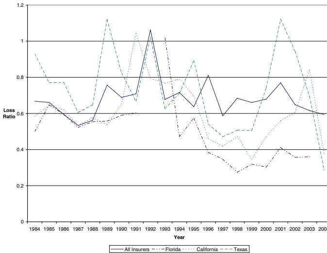
Fig. 2 Average “Firm-State” loss ratios in homeowners’ insurance, 1984–2004

sweeping out all time-dependent influences such as interest rate fluctuations and temporal trends in the number of firms writing homeowners insurance, as well as any other temporal effects.